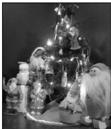
Left: Santas from around the world, which will be displayed at Crossroads Shopping Center. Pictured are Santas from Germany, Italy, Denmark, Russia, India and Ecuador, plus many more countries are represented on the tree. Golliver Family Santa Collection.

There will also be Santa and holiday-themed displays at the Winters House and Meydenbauer Theater for the community to enjoy.