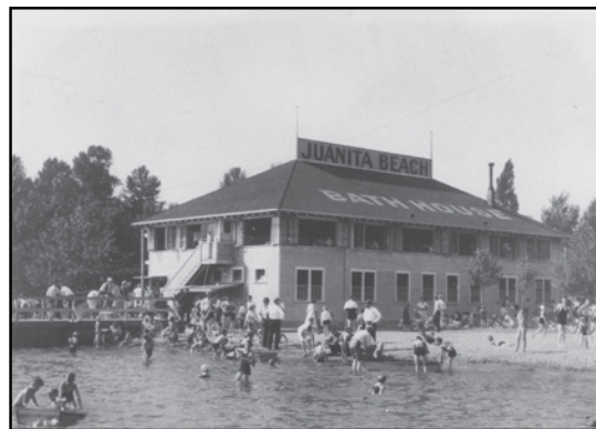
Above: Juanita Beach Bathhouse, circa 1935.

occasional rowdy weekends and Prohibition alcohol.