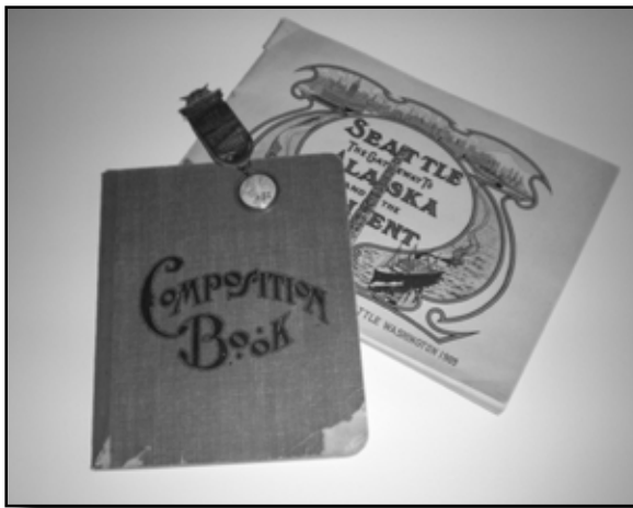
Left: Olga Carlson's composition book and two souvenirs purchased by her family during their visit, a souvenir view book and a Swedish Day Medal.

He brought us ice cream cones and many nice things which we liked very much. We went to see the University grounds two times. First in the day time and then at night. We heard many people sing. We saw the parade. One of my sister's friends in Seattle was in the parade. The day we went to Seattle was called the Swedish Day.