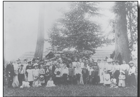
Above: Church Social at Wildwood Park, 1899.

In the late 19th century, a burgeoning ferry system made day getaways a popular form of recreation for Seattleites, and the eastern shore of Lake Washington became home to numerous resorts.