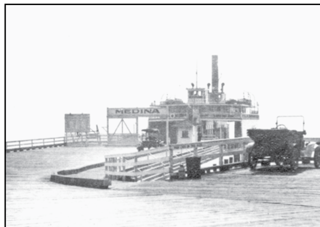
Above: The Medina ferry dock (date unknown).