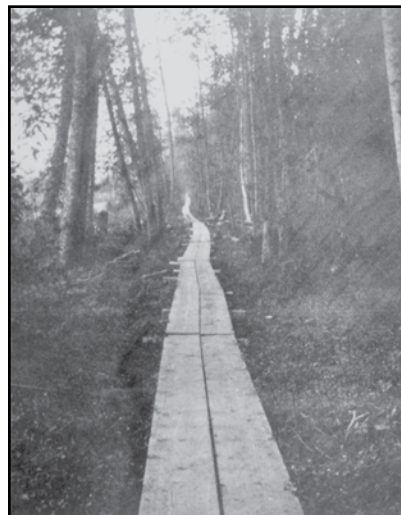
Above: The boardwalk which became Evergreen Point Road.