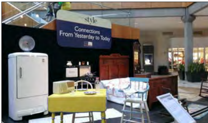
Above: Living in Style exhibit at Bellevue Square, January 2014.

replacement of old shelving at the McDowell House. This section of storage houses our Native American collection. New, sturdier shelving will