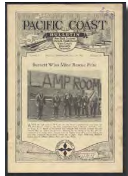
Above: Pacific Coast Coal Bulletin, July 27, 1927.

had to be taken on land to Portage Bay; and then again barged to Lake Union, and then again by rail to the Seattle docks. By the time the coal was loaded onto ships for its final voyage, it had been transferred eleven different times which added greatly to its cost of production.