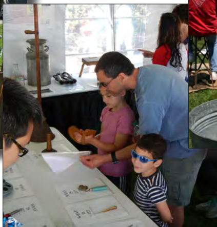
Left: What is it? items intrigue visitors in the Mini-Museum.