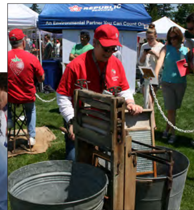
Above: Washboard & Clothes Ringer demonstration.