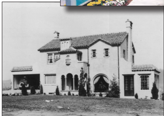
Winters House, ca. 1935.

As a Host at this historic home, you will: